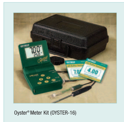
Oyster® Meter Kit (OYSTER-16)